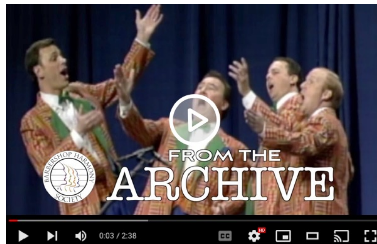
FRED - Name the Champs 1998 International Quartet Contest • Atlanta, Georgia

See both Revival and FRED on the AIC Show at Louisville , in person or livestreaming.