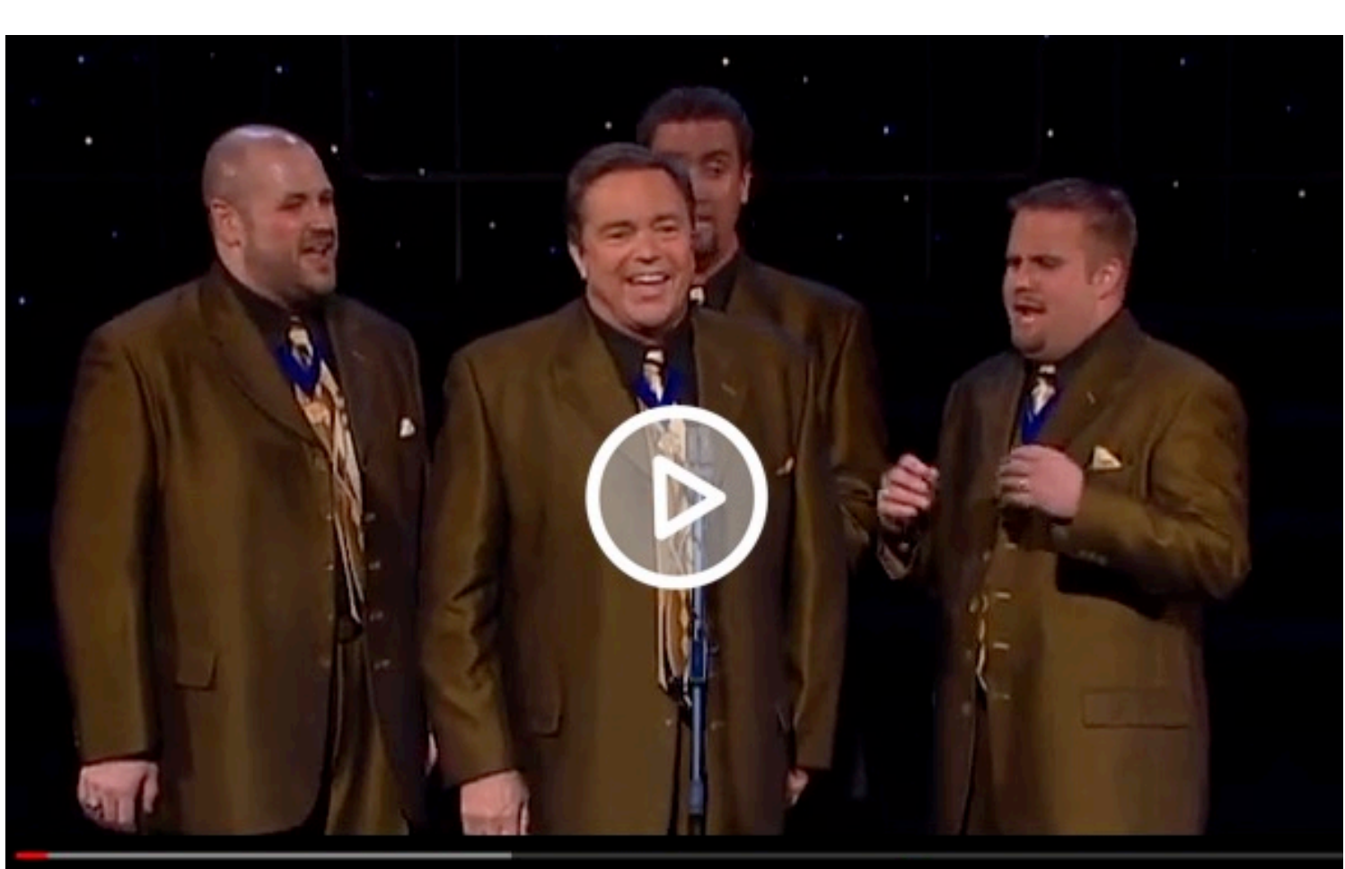
P.S. I Love You - Gotcha! 2005 International Convention • Salt Lake City