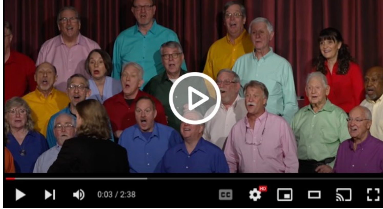
MAD Seniors Chorus • How Lucky You Are (from Seussical) 2024 Internatinal Seniors Chorus Contest • New York City