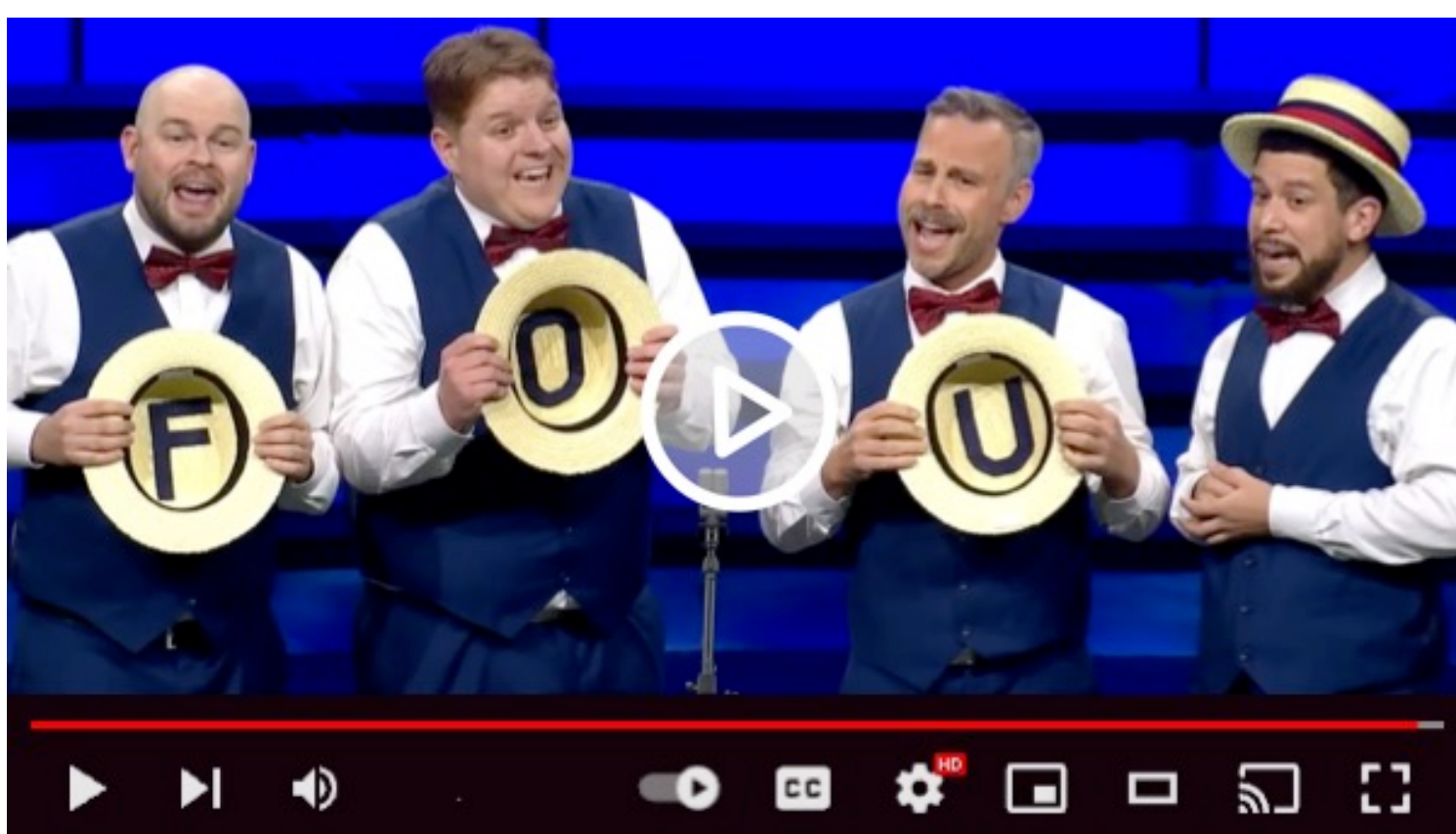
The Newfangled Four • L-O-V-E (Parody) 2025 International Quartet Finals • Denver