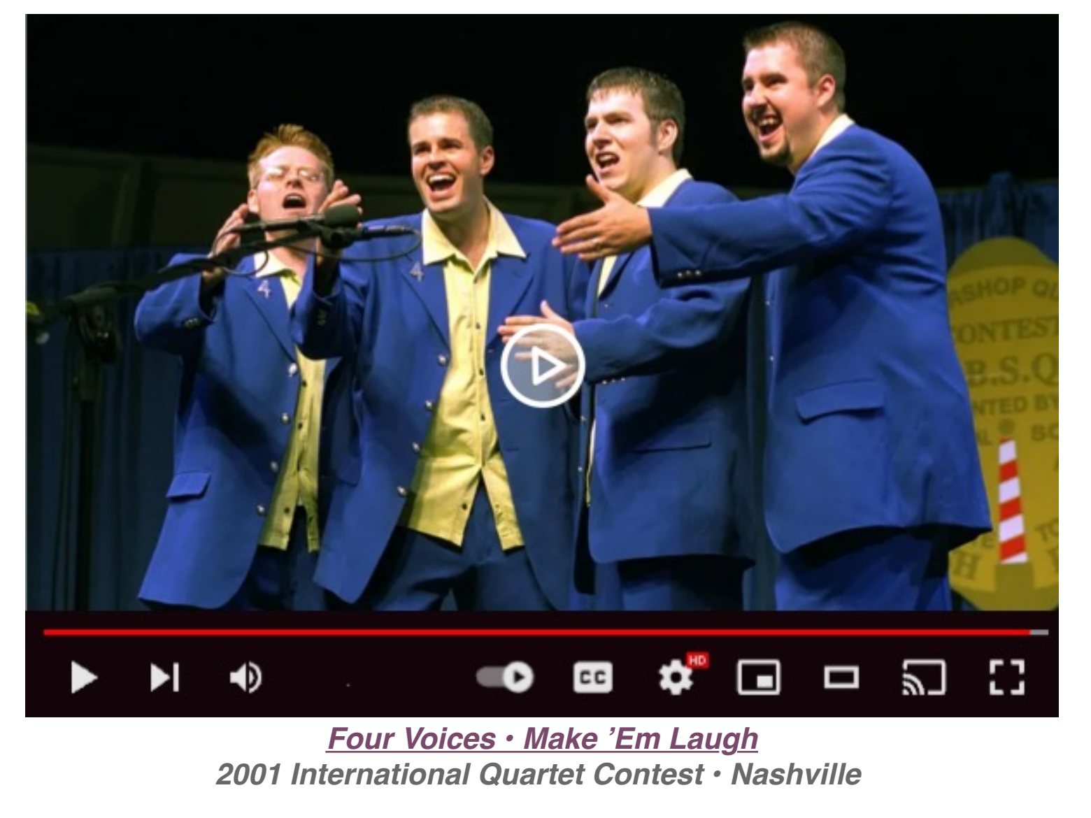
Four Voices - Make 'Em Laugh 2001 International Quartet Contest - Nashville